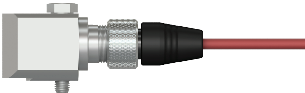
A fully-assembled non-integral sensor and cable assembly