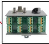
Steel DIN Rail Clip for Secure Attachment