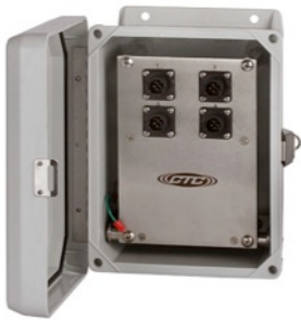
Four-pin Output Connectors

Designed for triaxial data collection, the MX303 fiberglass enclosure provides connection of the four-conductor input wiring for a maximum of four triaxial accelerometers for portable data collection. As an alternative, the MX303 can instead be manufactured to provide connection of the two-conductor input wiring of 12 single axis accelerometers or piezo velocity sensors. Data is collected via four, four-pin output connectors compatible with Azima DLI Data Collector Cables. Input wiring from the sensors is wired to the outputs via terminal blocks located behind the hinged output panel. Inputs available on each terminal block include positive and negative for each axis or sensor signal, and one input for the shield drain wire that is grounded via an external ground stud mounted to the side of the fiberglass enclosure.