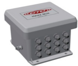
C. Nylon Cord Grips