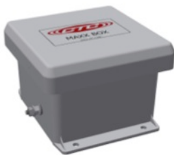
A. User Defined (Installed by user)

All MX303 enclosures feature a hinged cover with a mounted snap latch to protect each four-pin connector when not in use. Rated for NEMA 4X (IP66), the box is resistant to hose directed fluid and corrosion and is rated for temperatures ranging from -58° to 180°F (-50° to 82°C). Cable input options for the MX303 include: