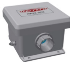
B. Conduit Fitting