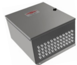
S. Stainless Steel Cord Grips