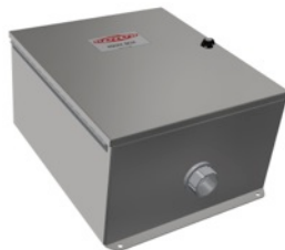
B. Conduit Fitting