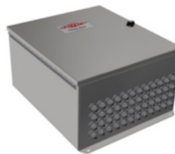
C. Nylon Cord Grips