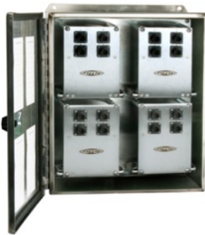
Four-pin Output Connectors

Designed for triaxial data collection, the MX403 stainless steel enclosure provides connection of the four-conductor input wiring for a maximum of 16 triaxial accelerometers for portable data collection. As an alternative, the MX403 can be manufactured to provide connection of the two-conductor input wiring of up to 48 single axis accelerometers or piezo velocity sensors. Data is collected via four, four-pin outputs compatible with Azima DLI Data Collector Cables. Input wiring from the sensors is wired to the outputs via terminal blocks located behind the hinged output panel. Inputs are available on each terminal block include positive and negative for each axis or sensor signal, and one input for the shield drain wire that is earth grounded via the stainless steel enclosure.