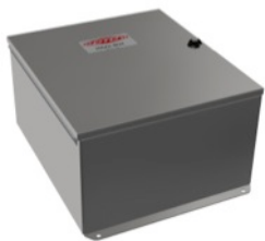
A. User Defined (Installed by user)

All MX403 enclosures feature a hinged cover with a mounted twist lock to protect each four-pin connector when not in use. Rated for NEMA 4X (IP66), the box is resistant to hose directed fluid and corrosion and is rated for temperatures ranging from -58° to 180°F (-50° to 82°C). Cable input options for the MX403 include: