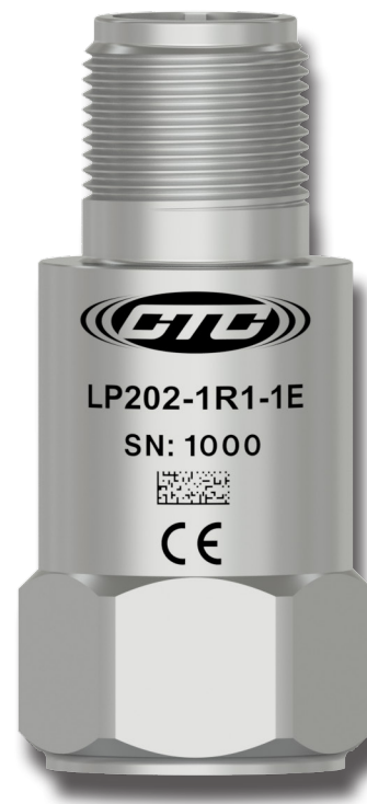
LP202-1R1-1E 4-20 mA Output Accelerometer