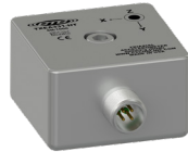
High Temperature Triaxial Accelerometer, Side Exit 4 Pin Mini-MIL Connector, 100 mV/g, ±5%

CTC also offers a variety of hazardous rated compatible accessories for a complete system: