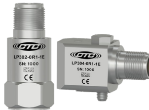
4-20 mA Output Proportional to Vibration in Acceleration

Dynamic Vibration Analysis allows for trended data and machine health diagnostics. However, Dynamic Vibration Sensors can be paired with CTC's SC300 Series Signal Conditioners to create a hybrid approach for both Process Monitoring and Dynamic Vibration Analysis.