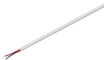
HYDRAULIC HOSE JACKETED CABLING