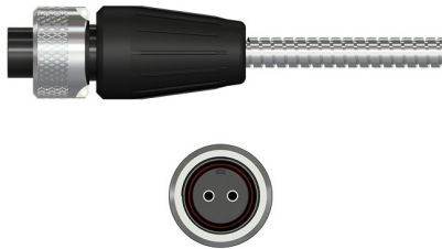
MIL-Style Connectors with Grounded Backshell