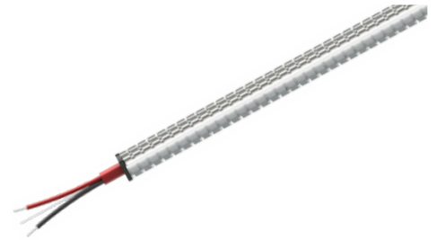
Armor Jacketed Cables