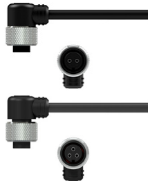
Nylon Molded Right Angle Connector