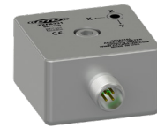
Low Frequency Triaxial Accelerometer, Side Exit, 4 Pin Mini-MIL Connector, 500 mV/g, ±5%