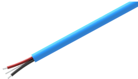
PLTC Jacketed Cable