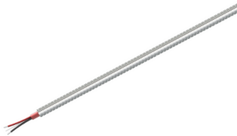
HEAVY DUTY ARMOR JACKETED