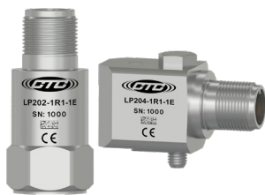
4-20 mA Output Proportional to Vibration in Velocity