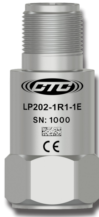
LP202-1R1-1E 4-20 mA Output Accelerometer