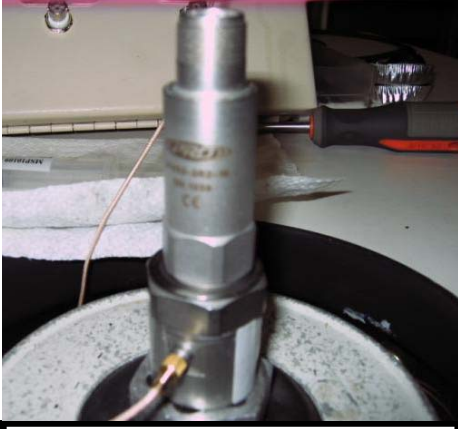
Figure 1—NIST traceable Reference sensor mounted “Back to back” with sensor being calibrated in production.

In order for an analyst to properly perform their job, they need to have tools they have confidence in and understand how to use. One of the primary tools for a vibration analyst is a properly calibrated sensor. Every sensor manufactured at CTC is calibrated using a reference sensor which is