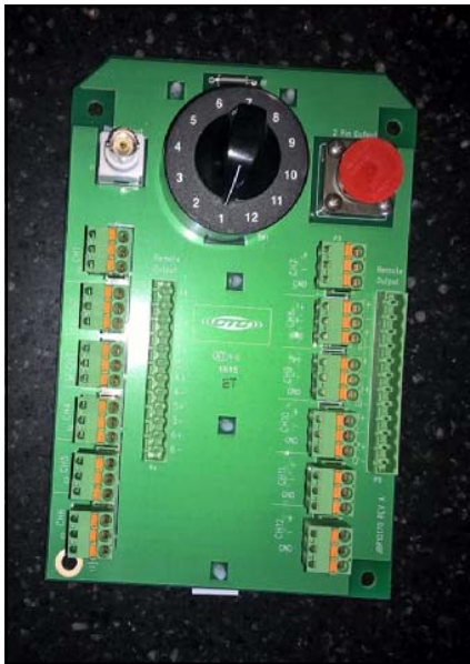
Figure 1—CTC's switch box panels would still only be available inside the box if customers did not ask for them to be made available as standalone products.

Replacement/expansion switch panels. Many customers order 24 or 36 channel switch-boxes, intending to expand to the full 48 channels our large enclosures are capable of at a later date. Buying just one more switch box panel can not only save on costs instead of buying an entire new switch box, but also could allow for additional machine monitoring.