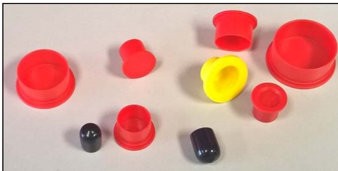
Figure 2— CTC's sensor, connector and mounting hardware caps would never have been sold individually if customers hadn't asked for spares.