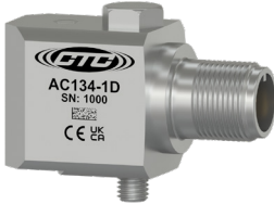
AC134 Standard Size, Side Exit