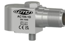
AC194 Compact Size, Side Exit