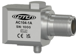
AC104 Standard Size, Side Exit