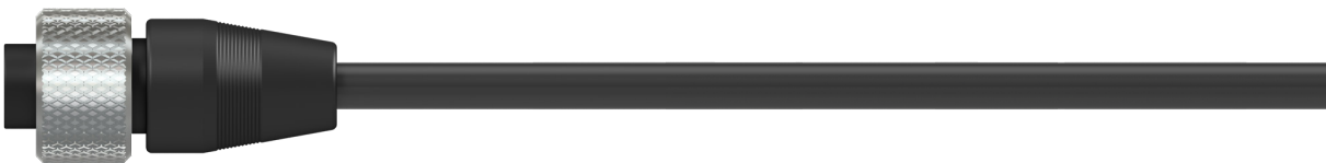
A2N 2 Socket MIL-Style, Nylon Molded Connector, Permanent Mount, 250 °F (121 °C) Max Temp