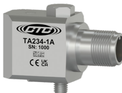
TA234 Dual Output Sensor, Temperature & Acceleration, Side Exit 3 Pin Connector, 500 mV/g, 10 mV/°C, ±10%