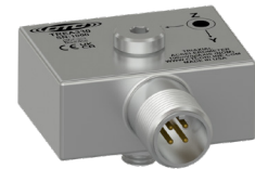
TREA330 Premium Miniature Industrial Triaxial Accelerometer, Side Exit 4 Pin Mini-MIL Connector, Follows Cartesian Phase Coordinate System, 100 mV/g, ±5%