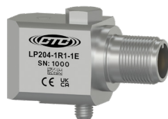
LP204 4-20 mA Output Proportional to Vibration in Velocity, Side Exit 2 Pin Connector