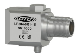
LP304 4-20 mA Output Proportional to Vibration in Acceleration, Side Exit 2 Pin Connector