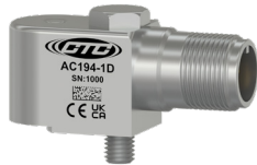
AC194 Compact Multipurpose Accelerometer, Side Exit 2 Pin Connector, 100 mV/g, ±10%