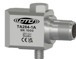
TA284 Dual Output Sensor, Temperature & Acceleration, M8x1.25 Captive Bolt, Side Exit 3 Pin Connector, 100 mV/g, 10 mV/°C, ±10%