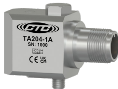
TA204 Dual Output Sensor, Temperature & Acceleration, Side Exit 3 Pin Connector, 100 mV/g, 10 mV/°C, ±10%