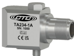
TA234 Dual Output Sensor, Temperature & Acceleration, Side Exit 3 Pin Connector, 500 mV/g, 10 mV/°C, ±10%