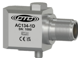
AC134 Standard Size, Side Exit