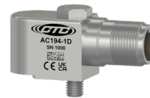
AC194 Compact Size, Side Exit