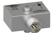
TREA330 Mini Size, Triaxial Side Exit

Low-frequency applications from 12 CPM to 30 CPM (0.2 Hz to 0.5 Hz) should use a 500 mV/g sensor like CTC's AC133, AC134, and TXFA331 series accelerometers.