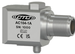
AC104 Standard Size, Side Exit