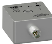
TXFA331 Standard Size, Triaxial Side Exit