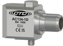
AC134 Standard Size, Side Exit