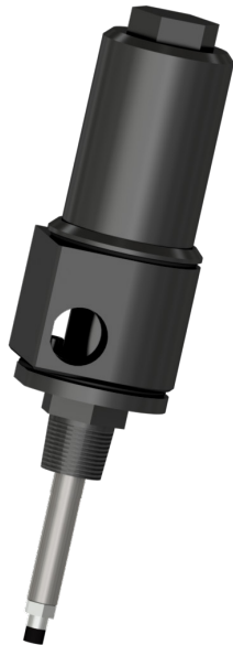
PRO Line reverse mount proximity probe housing assembly allows eddy current probes to be mounted as deeply into machines as 29.2 inches

Easily adjust the gap between the machine shaft and probe without shutting down a machine.