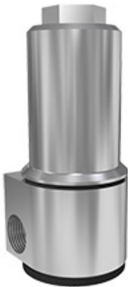
MH152-1A Protective accelerometer housing fully assembled except for the optional conduit. Two conduit access points are available, one on each side of the protective housing.

The MH152-1A is sized so as to be able to easily accommodate all of the standard types of CTC top exit sensors, from our smallest AC140-1D sensor up to our tallest LP800 and LP900 series sensors.