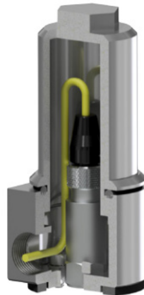
Cutaway rendering of the MH152-1A, showing the sensor installed in the housing.