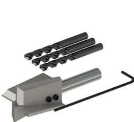
MH117-2A Installation Tool Kit, 1 in. (25.4 mm) End Mill Diameter for 10-32 Thread

CTC recommends stud mounting LP Sensors to the machine using CTC's MH117 Series installation tool kits with 1 in. (25.4 mm) end mill diameters.