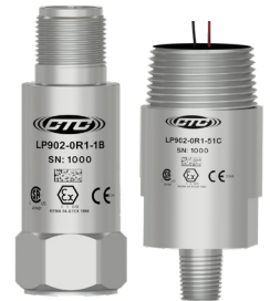
LP900 Series Hazardous Rated Loop Power Sensors with Acceleration Output

CTC recommends stud mounting LP Sensors to the machine using CTC's MH117 Series installation tool kits with 1 in. (25.4 mm) end mill diameters.