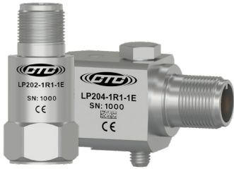
LP200 Series Loop Power Sensors with Velocity Output

CTC offers a wide variety of Loop Power Sensors which are designed to withstand the harshest industrial environments and can be customized to focus on the most important frequencies for your application. Our LP Series Sensors come in standard connector exit, molded integral, and armored integral options with 4-20 mA output proportional to acceleration or velocity. Dual Output Loop Power Sensors with a 4-20 mA vibration output and °C temperature output, as well as hazardous rated options, are also available.