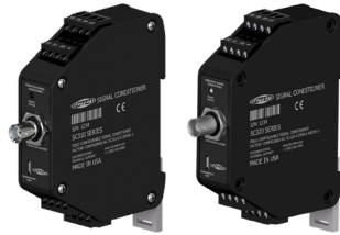
SC300 Series Signal Conditioners