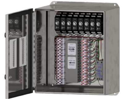
SCE410 Series Stainless Steel Enclosure for 1 to 8 CTC Signal Conditioners

CTC's SC300 Series Signal Conditioners feature dual band technology, allowing the user to set two bands of 4-20 mA output from one sensor. This dual band technology is ideally suited for simultaneous monitoring of standard vibration faults in conjunction with early bearing fault detection or lubrication monitoring. When utilizing an SC320 Series Signal Conditioner with CTC's UEB330 Series Dynamic Vibration and Ultrasound Accelerometer, the user can set one band pass filter to the ISO standard filter of 10 Hz to 1 kHz to automate the vibration output from the UEB330 Series Sensor, and a second pass band filter to 20 kHz to 40 kHz to automate your ultrasound band. Signal Conditioners are DIN rail mountable in CTC's SCE Enclosures. SCE Enclosures come in fiberglass and stainless steel options, and can fit up to eight Signal Conditioners per box. When ordered at the same time, CTC will install and wire your Signal Conditioners and Power Supply in the enclosure for easy installation.