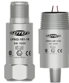
LP800 Series Hazardous Rated Loop Power Sensors with Velocity Output