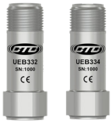
UEB330 Series Dynamic Vibration and Ultrasound Sensors

Signal Conditioners can be used in conjunction with standard dynamic accelerometers, piezo velocity sensors, or displacement probes. The Signal Conditioner accepts the dynamic input and converts it to a proportional 4-20 mA, 0-20 mA, 0-5 Vdc, or 0-10 Vdc output for the PLCs, DCS, or SCADA system. The Signal Conditioner can be adjusted in the field so that the scaling and filters match your application. The benefit to using a Signal Conditioner is that the dynamic vibration signal is available from a standard BNC connection on the front of the Signal Conditioner, or as an optional output from the terminal block.