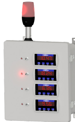
SCD100 Series Relay & Display Enclosure for 1 to 4 CTC Signal Conditioners