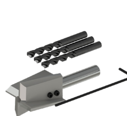
MH117-3A Installation Tool Kit, 1 in. (25.4 mm) End Mill Diameter for 1/4-28 Thread