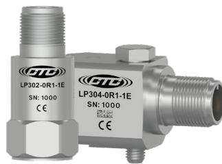
LP300 Series Loop Power Sensors with Acceleration Output