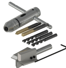
MH117-2B Installation Tool Kit, 1 in. (25.4 mm) End Mill Diameter for 10-32 Thread, with Tap Set