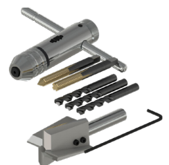
MH117-3B Installation Tool Kit, 1 in. (25.4 mm) End Mill Diameter for 1/4-28 Thread, with Tap Set

LP Sensors are compatible with all standard CTC connectors and cabling. Popular options include: