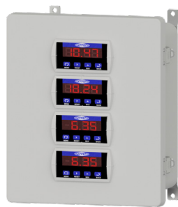
PMX Series Relay & Display Enclosure for 1 to 4 Single Output Loop Power Sensors

CTC offers PMX Series Enclosures for use with Loop Power Sensors, as well as SCD100 Series Enclosures for use with Signal Conditioners, which feature displays on the front of the box, which are capable of displaying the vibration level from the Loop Power Sensor or Signal Conditioner and also triggering alarms and shutdowns based on the amplitude of the overall vibration within a selected frequency range. These boxes are essential to protecting critical machinery from excessive vibration, which can cause catastrophic failure and downtime.