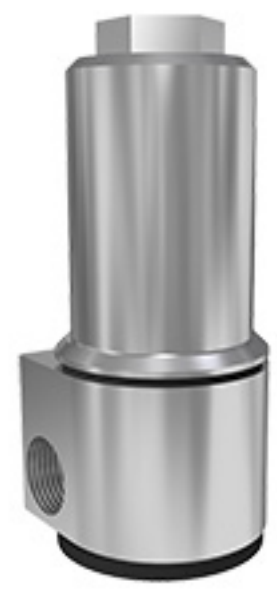
MH152-1A Protective accelerometer housing fully assembled except for the optional conduit. Two conduit access points are available, one on each side of the protective housing.

The MH152-1A is sized so as to be able to easily accommodate all of the standard types of CTC and PRO Line top exit sensors, from our smallest AC140-1D sensor up to our tallest LP800 and LP900 series sensors.