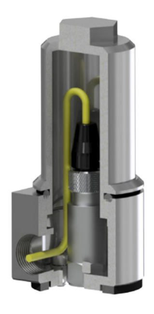
Cutaway rendering of the MH152-1A, showing the sensor installed in the housing.