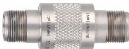
HA602-Charge Amplifier .

For some high temperature applications the internal electronics of the IEPE sensors are subject to failure at the elevated temperatures. . CTC's high temperature accelerometer solutions have a fundamentally different construction to solve this problem. The design separates the sensing element from the electronics, with the two permanently connected by a hardline mineral insulated cable. The current offering of these sensors allow the sensor head to be mounted on surfaces with temperatures as high as +350C (+650°F). Due to this separation, the electrical part of the sensor can be installed in a cooler location. This permits the operation of these sensors at significantly higher temperatures while providing overall system performance