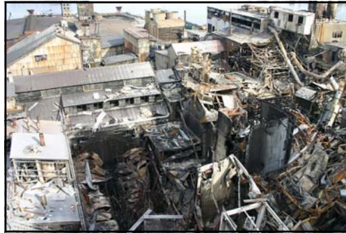
Figure 2-Damage from a sugar factory explosion in 2008. Investigators suspect the explosion was caused by sugar dust.

In order to reduce the likelihood of catastrophic accidents many areas have particularly stringent requirements as to how much energy can be utilized by process equipment in selected areas of certain manufacturing facilities. Hazardous or intrinsically safe areas are designated to avoid igniting explosive dusts or gases. In order to make sure that sensors and cables used in these areas will not provide sparks or excessive heat that could