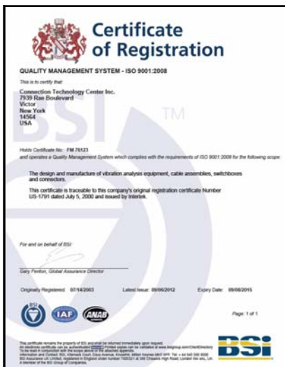
Figure 1—CTC's ISO9001:2008 certificate of registration. Certificates such as this one must be renewed on a regular basis.

If you have any questions or for further information please feel free to contact CTC directly via Email at techsupport@ctconline.com or call 1-800-999-5290 in the US and Canada or +1-585-924-5900 internationally.