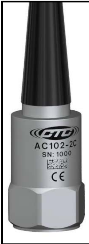
Figure 1. Integral polyurethane jacketed sensor showing the molded integral cable and polyurethane molded strain relief.

Many industrial processes have a requirement for sensors to be submerged. Whenever sensors are submerged they must be properly designed to meet certain requirements depending on the environmental conditions where they will be immersed.