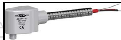
Fig. 3. Integral armor jacketed cables are recommended for use where abrasives or other solids are present in the liquid where the sensor is submerged.

In other situations where extra durability is required, armor jacketed Teflon cables are recommended. Manufactured with the same processes as the other integral cables above, the integral armored cables can be used in applications where there may be abrasive materials present, such as sand or gravel, or where there may be other material included in the water flow such as wastewater or industrial processing of other materials.