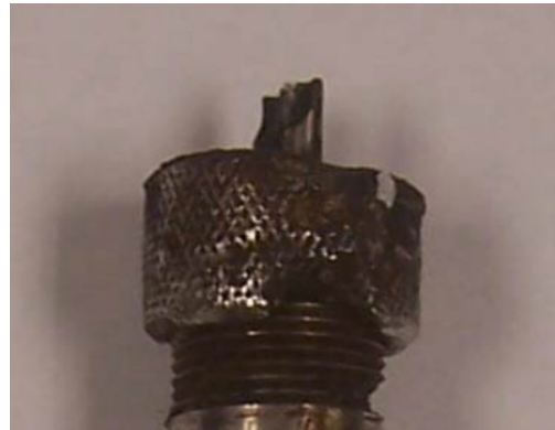
remnants of a CTC A2A connector where the polycarbonate has completely disintegrated and the stainless locking ring has been seriously eroded due to the sulfuric acid

For situations requiring exposure to lower concentrations of sulfuric acid, CTC has developed PPS connectors with no exposed metal.