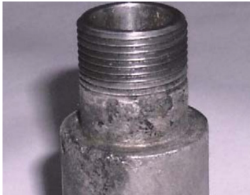
stainless steel sensor body showing the effects of sulfuric acid corrosion

Sulfuric acid corrosion in many materials is dependent upon the acid concentration. Many materials that will not corrode when in contact with 98% concentrations of sulfuric acid may suffer significant corrosion at lower concentrations. Stainless steels are one of the material groups that can withstand very high concentrations of sulfuric acid (93% - 98% concentrations) but suffer significant corrosions at lower concentrations.