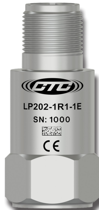
LP202-1R1-1E 4-20 mA Output Accelerometer