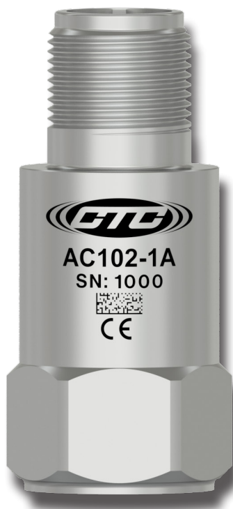
AC102-1A Dynamic Output Accelerometer

The main difference between these accelerometers is in the way the processor and internal amplifier process and output the vibration signal affecting the sensor.