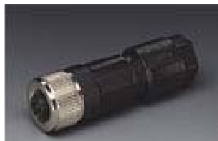
Field installable M12 connector

CTC also offers a factory installed connector (C502) to mate with these sensors, and field installable connectors are available upon request.