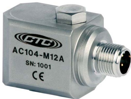
CTC's AC104 Side exit sensor with M12 four pin connector. "AC104-M12A"

M12 connections are very common in process and instrumentation fields, especially in Europe. The general acceptance of these connectors in sensors buses and field buses, as well as the general availability of those type of connectors,