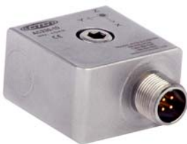
AC230-1D Triaxial sensor

Triaxial sensors are offered by many manufacturers. CTC's offerings include the following sensor series: AC230 and AC115.