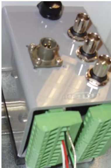
CTC's TSB1000/2000/3000 series switch boxes accept inputs from triaxial sensors into one easy to install wiring block.

The wiring convention most manufacturers use is fairly common in the industry, where colored wires are "positive" or "signal" wires and black wires are "common" or "ground" wires. The illustration at right shows how easy it is to install the four wire output leads into a specialty junction box designed specifically for these sensors (TSB1000/TSB2000 and TSB3000