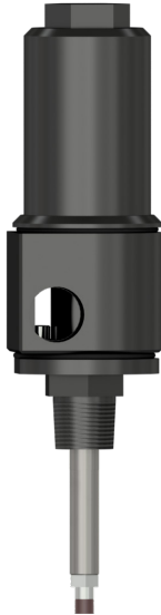
PRO Line reverse mount proximity probe housing assembly allows eddy current probes to be mounted as deeply into machines as 29.2 inches

Easily adjust the gap between the machine shaft and probe without shutting down a machine.