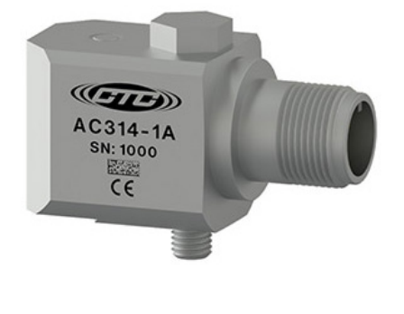
AC314-1A LOW POWER SENSOR

wireless connectivity. As a result, consumers are able to take advantage of our quality, shear mode accelerometer