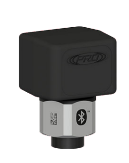
WA102-1A WIRELESS TRANSMITTER

As compared to all-in-one wireless sensors, this two-part design ensures reliable readings as the internal design of the sensors are not altered to accommodate